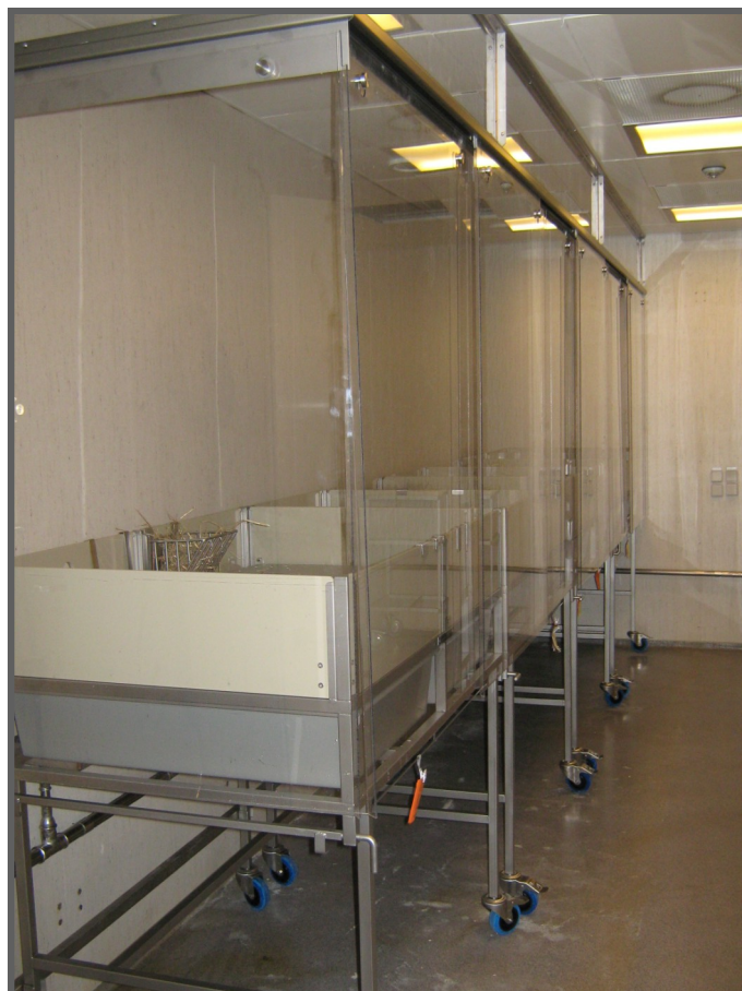
Sliding curtains in front of guinea-pig caging ...

The curtains are suspended on roller bearings making them easy to slide from one side to the other thereby gaining access to the animals.