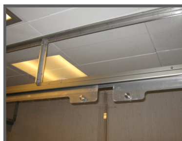
A top skirt is often inserted between the ceiling and the curtains ...