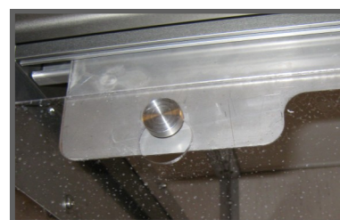
The curtains sections are easy to dismantle ...