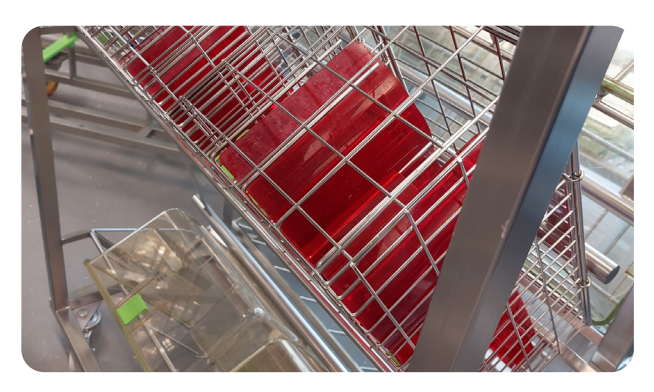
Material: Stainless steel wire basket. Dimensions: 486mm (L) x 236mm (D) x 209mm (H)